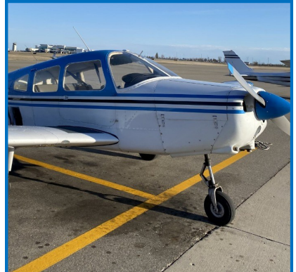
plane was not nearly as easy as it is in the simulator. lt's almost like a leg and an arm workout controlling the rudders and the yoke since it was getting blown around a lot."

Red River High School hosted an unforgettable event where they celebrated cyber excellence. A big shoutout to the Cyber Madness State Championship team from Red River HS for their outstanding achievement! And let's hear it for the 3 recipients of the National Center for Women and Information Technology - Aspirations in Computing Award! It is with pride to recognize the 3 National Cyber Foundation Scholar award winners! Keep shining brightly, everyone!